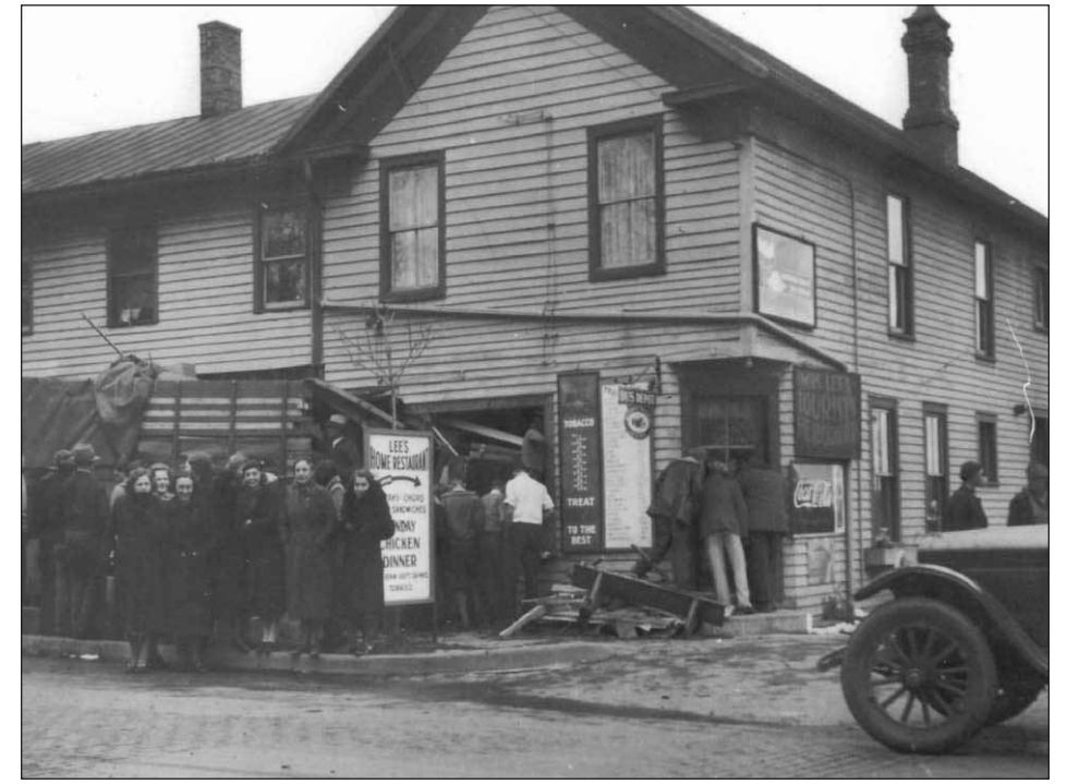
SCHOOL GIRLS posed for a photo at the pumpkin wreck in the 1920s in Lexington.