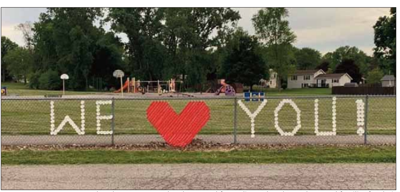
WESTERN ELEMENTARY placed a message on the playground fence directed to the students and families for their support during the remote learning process.