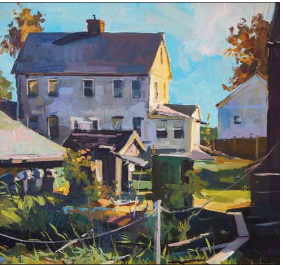
Morning Light Essex by Chris Leeper

The bureau also announced updated plans to count people experiencing home-